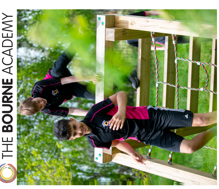
Steps to ASPIRE Resilience