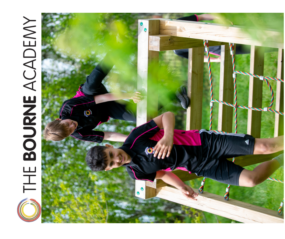
Steps to ASPIRE Resilience