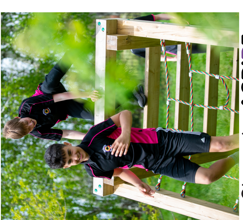
Steps to ASPIRE Resilience